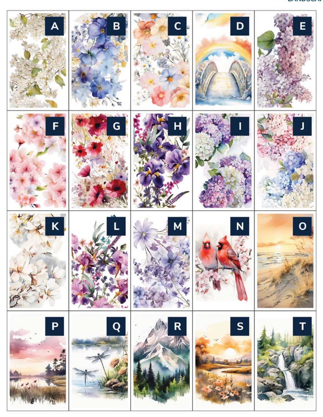
Submit your own image for no extra charge. You must have the rights to use images you submit. Find free images on unsplash.com or purchase images on any stock website.

Contact us with questions, for pricing quotes, or to request a free sample. Toll free: 877-513-0099 | Email: info@QOLpublishing.com